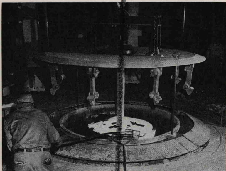
Left, a close-up view of the pouring tank and cover.